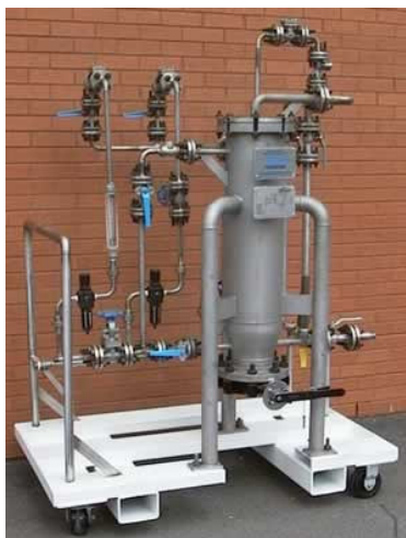
LKF Candle Filter Skid Rental System

Home | Contact | Newsletter | Rental Filters | Products | Technical Articles Presentations | Application Data Sheet | FAQ